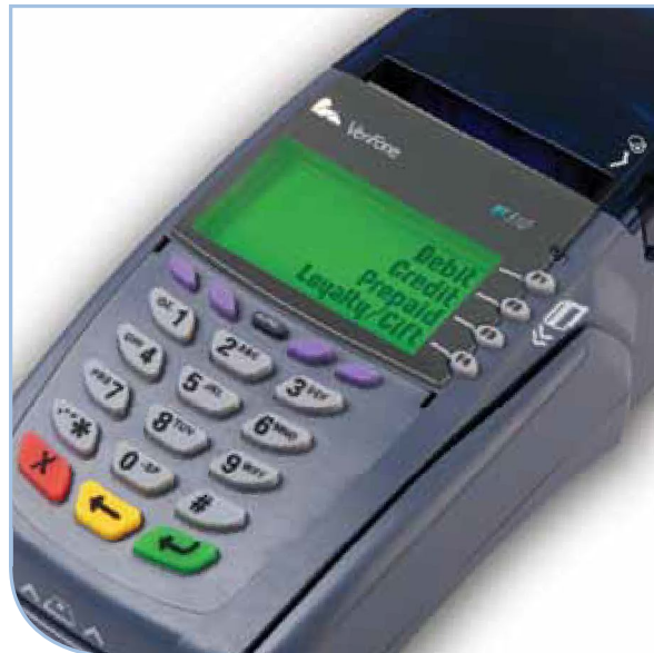
VeriFone® Omni Vx Series